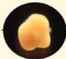
A Bundle of Eggs and Sperms

Many Acropora corals spawn around full-moon night in May or June in Okinawa.