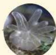
Polyp (Coral Baby)

Planula larvae may well settle on to well-prepared artificial substrate with the density more than 2 inds per cm 2 .